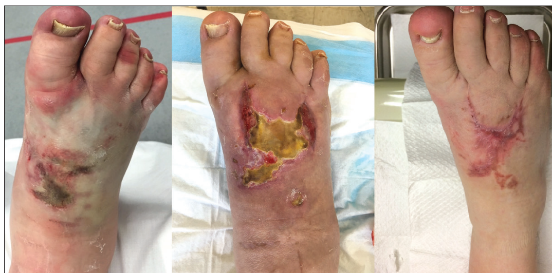
Figure 6: Crush injury and compartment syndrome after patient's foot got stuck under road milling machine. Wound healed at 4 months following emergent fasciotomy, debridements, and skin substitute application.

Historically, emergent surgical debridement of open fractures was recommended within six hours of the injury; however, recent literature has challenged this recommendation. Schenker, et al. performed a systematic review looking at 3,539