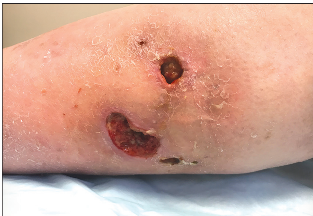
Figure 3: Wound to lateral leg following cat bite. Wound healed in 8 weeks with debridement, local wound care, and compression.

Figure 1 demonstrates a 61-year-old healthy male who suffered a chainsaw injury. The patient presented to the Emergency Department with a first metatarsophalangeal joint laceration and associated extensor hallucis longus tendon injury. Tetanus status was assessed, antibiotics administered, and irrigation performed in the emergency department. MRI revealed a greater than 2 cm gap at the extensor hallucis longus ten-