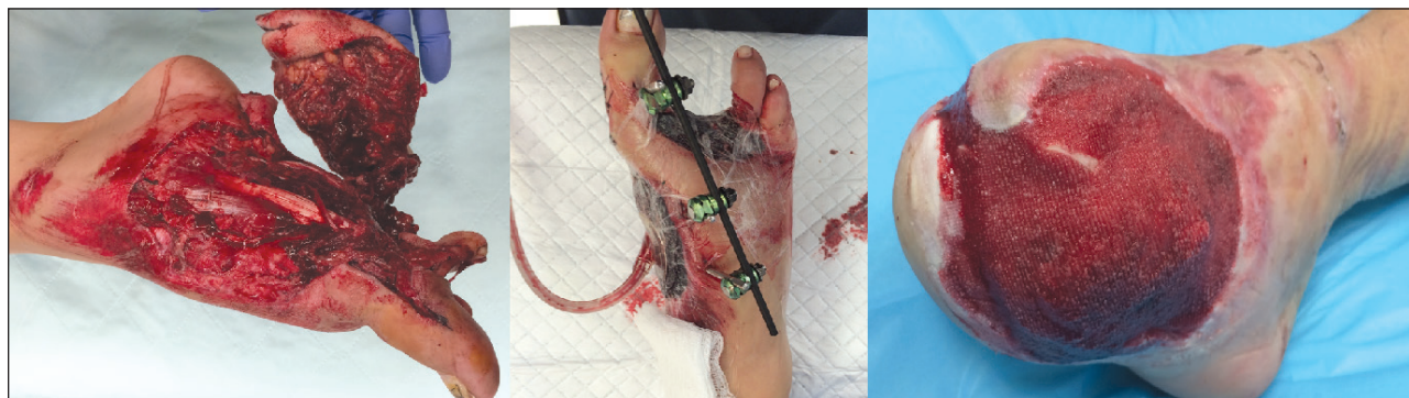
Figure 7: Degloving injury after patient was struck by a vehicle. Following emergent reduction, washout, and partial amputation, patient underwent serial washouts prior to transmetatarsal amputation.

Hyperbaric oxygen therapy (HBOT) has been widely used in