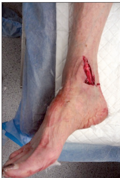
Figure 5: Open fracture following fall on the ice. Wound healed uneventfully following surgical washout and delayed primary closure.

ronment through a break in the skin. Open fractures of the tibia are the most common open long bone fracture, occurring in 3.4 per 100,000 people annually, primarily from high energy trauma. 4,5 Since its description in 1976, the Gustilo Anderson Classification has been the most widely used classification for open fracture management. The rate of infection correlates with the grade of fracture, with 0-2% in Grade I, 2-7% in