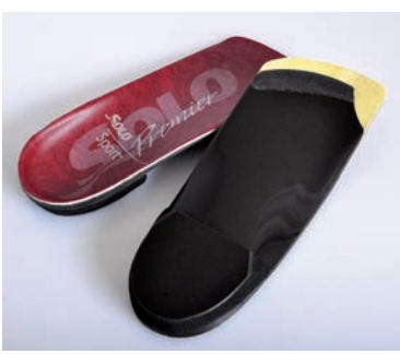
Solo's sport orthotic

In 2010, SOLO began internally developing CAD/CAM technology with the goal of completely replacing the remaining poured plaster molds for the most complicated orders. After four years and hundreds of software versions, SOLO is now able to duplicate the most complicated plaster casts electronically. We continue to innovate through various system and process improvements that set the