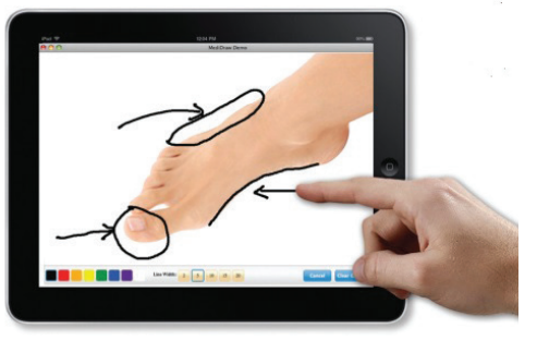
Easy image upload and MediDraw feature allows you to take pictures with your iPad or phone, upload them and draw right on the image.