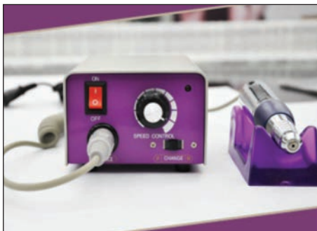
Figure 2: E-file Manicure Drill

Water Spray Drills are also available. With Water Spray Drills the burr and the involved area are cooled by a mist spray of distilled water. Some podiatrists prefer the Water Spray Drill when they work on hardened