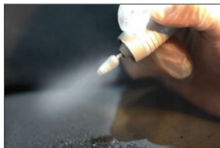
Figure 3: BNA BURZ Waterspray Drill

Medical burs should be consistently well balanced and remain sharp, even after being autoclaved. BNA Burz have been shown to remain sharp after being autoclaved multiple times. Not all drills and burs on the market are medical grade or meet FDA standards or are FDA-registered.