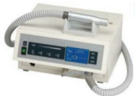
Figure 4: BNA BURZ Vacuum Drill

Vacuum Drill, Water Spray Drill and all BNA Burz are classified as “medical devices” and are FDA-registered. They are also ISO/IEC/CE. This offers