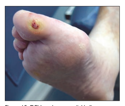
Figure 15: DFU at plantar medial hallux area present for three months.

mity when an apices or distal plantar toe ulcer is present. The author recommends treating soft tissue infection with appropriate antibiotics before performing a flexor tenotomy unless immediate surgical treatment is warranted. The presence of osteomyelitis is not a contra-indication for the procedure. The patient must have adequate circulatory status to heal both the ulcer and the surgical trauma. The technique is contraindicated in ischemic ulcers. Fortunately, most diabetic foot ulcers are non-ischemic.