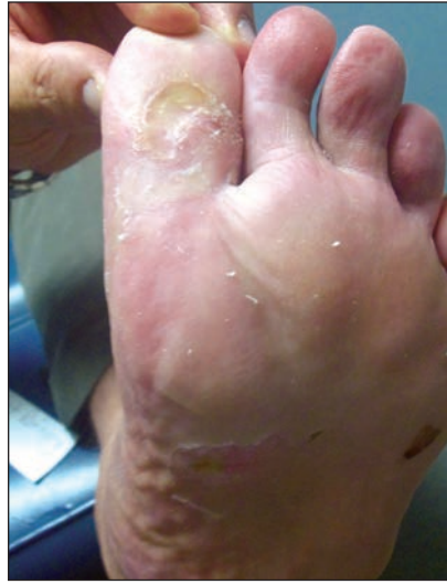
Figure 21: The ulcer in Figure 20 (FHL tenotomy and distal plantar fascial release) at 2 weeks post-op.

She stated that initial treatments by the first provider had healed the ulcer but the ulcer kept returning. She was diagnosed with osteomyelitis and an amputation was recommended. The patient sought a second opinion from the author, who scheduled her for a flexor tenotomy. The ulcer healed in 21 days and has remained Continued on page 125