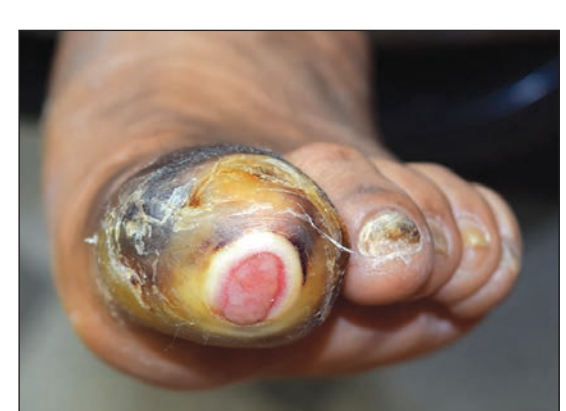
Figure 1: A neuropathic diabetic apices toe ulcer with osteomyelitis.

ropathic ulcers is the most effective way to heal and prevent re-occurrence of diabetic foot ulcers (DFU). Surgical intervention is particularly suitable for neuropathic digital apices ulcers.<sup>1-3</sup>