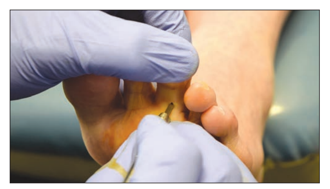
Figure 6: A sweeping motion of a 316 Blade utilized to transect flexors without bone contact.