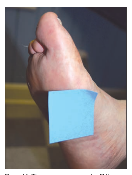
Figure 16: Three-year post-operative FHL tenotomy of FHL in patient depicted in Figure 15.