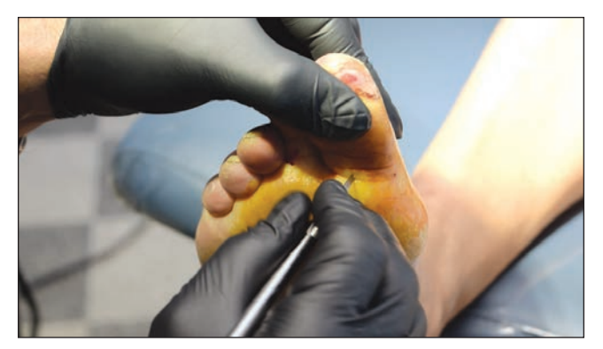
Figure 9: Incision placement is one cm. from the 1st MPJ with hallux FHL tenotomy.

A study by Frigg, et al. in Foot Ankle International found the re-occurrence of ulcers after total contact casting to be 57%. In this study, some of the patients also had surgical intervention after initial healing with TCC. This would suggest that re-occurrence with TCC was higher than 57%.24 A better comparative study reported an 80% re-occurrence rate Continued on page 122