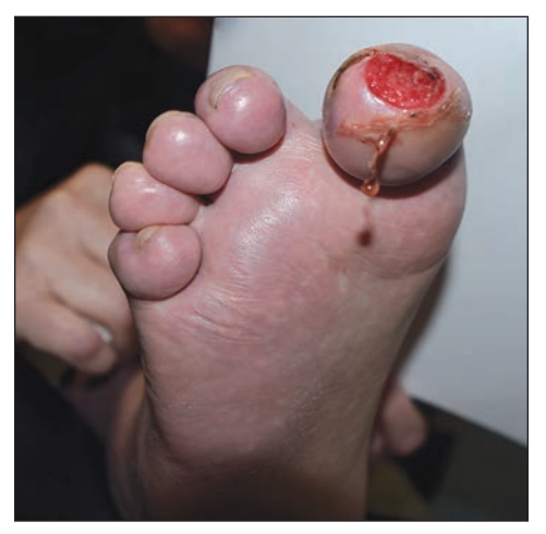
Figure 17: Hallux Ulcer present one year despite extensive conservative treatment.