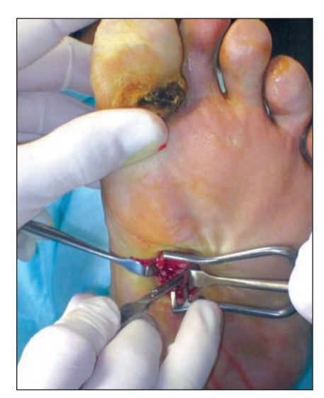
Figure 20: Distal plantar fascial release to increase dorsiflexion of hallux without sacrificing the brevis tendons.

self-treatment with pocket knife trimming and salt water foot soaks. The patient presented to the office after self-trimming the area and developing an infection. Initial treatment included stabilizing the infection with oral antibiotics and dispensing of a surgical shoe. The patient was compliant with the conservative care. Ten days later, a percutaneous FHL tenotomy was performed and the ulcer healed in two weeks. The patient has remained ulcer-free for three years and maintains appropriate routine foot care appointments. He has made significant lifestyle changes and is achieving better control over his diabetes (Figures 15 and 16).