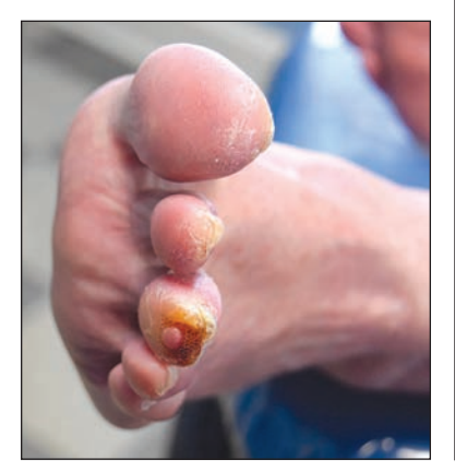
Figure 13: 3rd toe ulcer in diabetic patient present for six weeks.