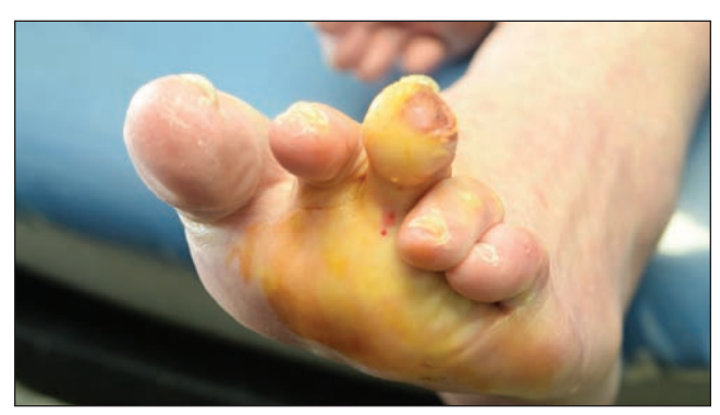
Figure 8: The digit assumes a more rectus position once the flexor tendons are transected.

pressure-relieving footwear has been reported as problematic.14