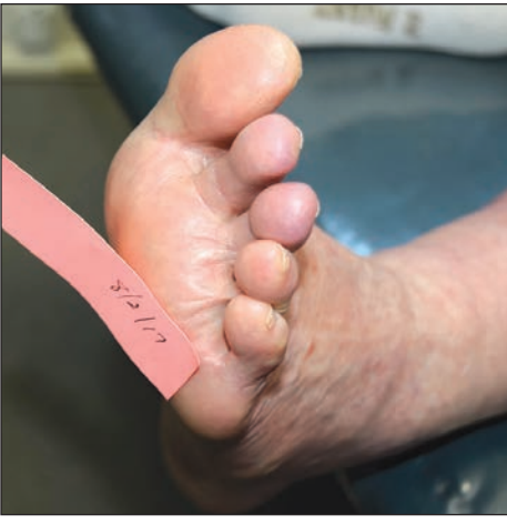
Figure 14: Two-week post-op percutaneous flexor tenotomy on patient represented in Figure 13.

with TCC alone.<sup>25</sup> It was suggested by the authors in these studies that foot deformities should be operatively corrected immediately after primary healing with TCC rather than waiting until there are further recurrences. In conclusion, correcting the foot deformity has better outcomes than conservative off-loading (Figures 2 and 3).<sup>24</sup>