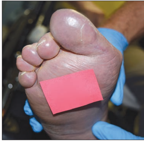
Figure 18: 18 months post FHL tenotomy in patient depicted in Figure 17.