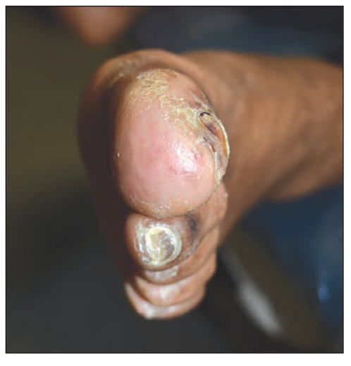
Figure 19: Hallux Ulcer 21 days post FHL tenotomy despite concurring of osteomyelitis

The patient is a 72-year-old male with moderately controlled type II diabetes. Previous treatments included