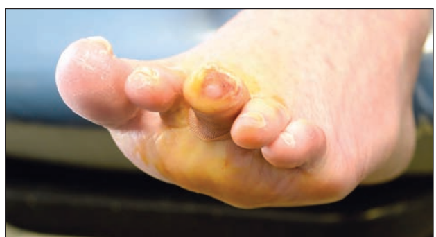
Figure 12: The digit is splinted into rectus position with band-aid.