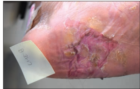
Figure 3: The same patient depicted in Figure 2 eight weeks after percutaneous ATL performed under local anesthesia.

The toes are at risk for ulceration, with studies showing digits 1–5 ac-