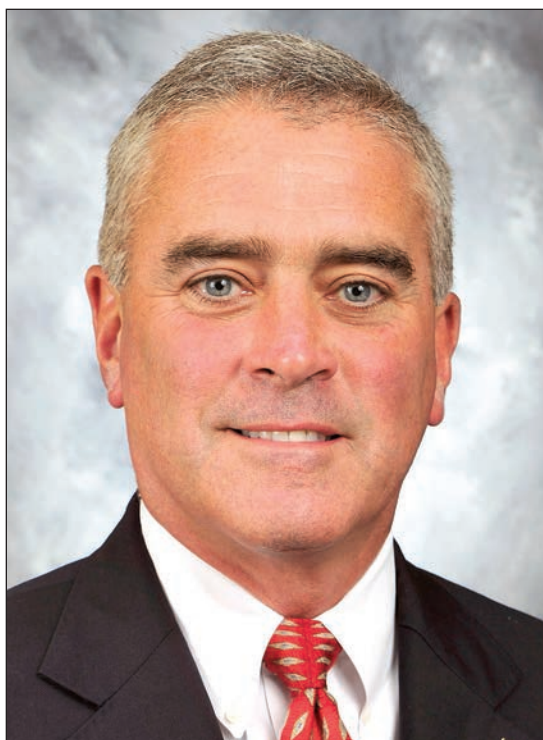
Dr. Brad Wenstrup

Rep. Wenstrup introduced the American Podiatric Medical Association's (APMA) VA Provider Equity Act