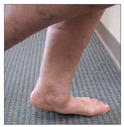
Figure 2:The single foot heel rise is difficult to perform if not impossible in Stage 2 AAF.

into a comfort zone and prescribe the same type of AFO device for every patient they treat with AAF. Falling into this treatment habit would be equivalent to performing the identical surgical procedure for every case of AAF. In short, this condition has various levels of severity which require different types of AFO bracing. As with surgical procedures, preser-