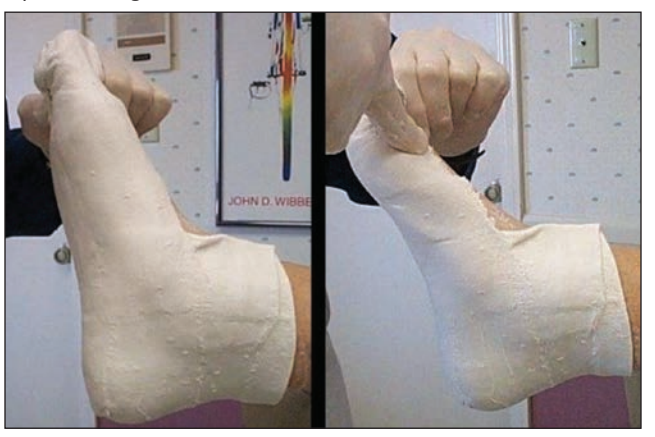
Figure 3: Neutral suspension impression casting with reduction of forefoot supinatus in Stage 2 AAF:

The adult acquired flatfoot requires specific modification or enhancement of the standard prescription for fabrication of foot orthoses these enhancements are de- trol as described by Carlson<sup>15</sup>.