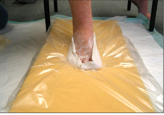
Figure 2: Cast B: Semi-weight-bearing casting (SWC): Patient seated, subtalar joint neutral, plantar surface of foot placed on a two inch thick foam rubber block with very slight downward force applied to the knee to seat in the foot in the foam rubber, no manual positioning of the midtarsal joint or forefoot, tibia aligned to maintain neutral position of the subtalar joint

When the first podiatric ankle foot orthosis, the Richie Brace®, was introduced by Doug Richie D.P.M. in 1996, the differentiating feature of this device was a functional foot orthotic foot plate which was fabricated from a neutral suspension cast. This was a departure from previous tradition in the orthotics industry where standard AFO's were fabricated from impression casts taken of the feet in a partial or full weight-bearing position. This article will