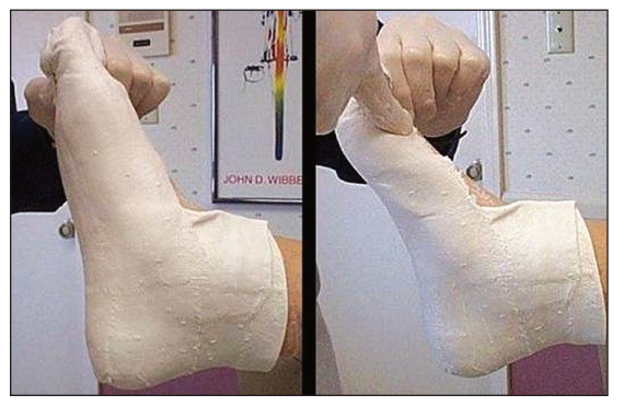
Figure 14: Acquired forefoot supinatus deformity can be reduced in the suspension cast by pushing down on first ray.

some interesting findings. Both the semi-weight-bearing and full weight-bearing casting conditions resulted in inversion (supination) of the forefoot. Conversely, the non-weight-bearing suspension cast demonstrated a four degree everted forefoot position, which was an eleven degree difference from the semi-weight-bearing cast. It is interesting to note that the semi-weight-bearing condition actually resulted in more forefoot supination than did the