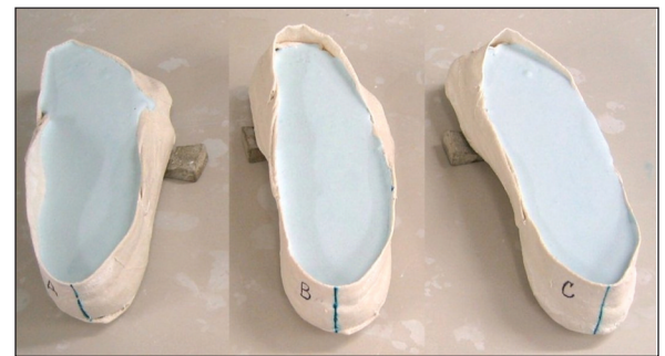
Figure 5: Wedges placed under forefoot areas of casts to align the heel vertical. Plaster of Paris is poured into negative casts