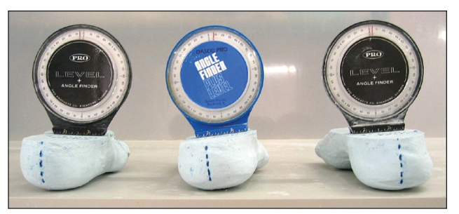
tion and the mid- Figure 6: Forefoot eversion or inversion position differs signifitarsal joint in a cantly between the three cast techniques