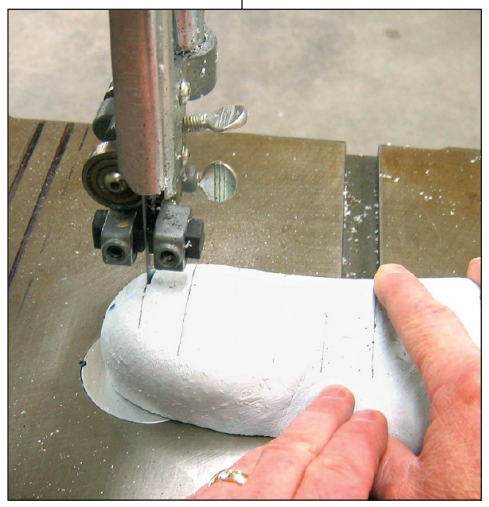
Figure 8: Cutting cast with band saw

three different types of foot orthotic devices: a flat insole, and "molded" foot orthosis fabricated from a neutral suspension cast. and a "molded and posted" device also made from a neutral suspension cast. The authors concluded that molding or contouring of the device to the