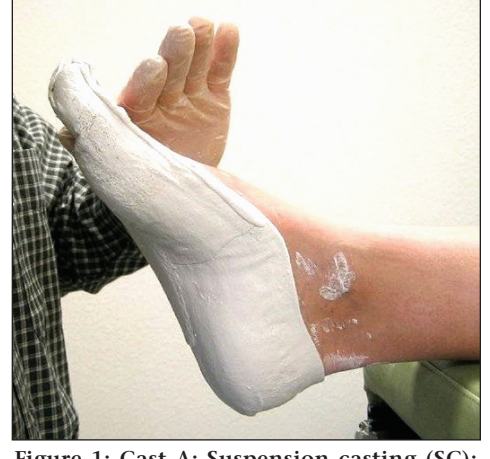
cal to overall Figure 1: Cast A: Suspension casting (SC): efficacy of the Supine technique, subtalar joint neutral, middevice. tarsal joint fully pronated

parameters regarding positioning of the foot during the negative casting process. The orthoses are designed to capture specific alignment of the osseous segments as well as contours of the foot anatomy which are critiefficacy of the device.