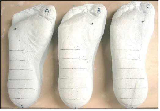
Figure 7: After completing all measurements, the casts were progressively sectioned in the frontal plane with a bandsaw at two centimeter increments starting at the most posterior aspect of the heel

Anterior to the heel area, the cast should capture the medial and lateral longitudinal arches of the foot and any inverted or everted angle of the forefoot (i.e., forefoot varus or valgus). A functional orthosis should support the medial and lateral longitudinal arch of the foot to reduce the extent of lowering of these structures that occurs when there is closed chain subtalar joint pronation. It is also important to provide support for any inverted or everted forefoot deformity. It may be advantageous to reduce any forefoot supinatus (acquired or false forefoot varus) in the foot during the casting process (Figure 14). Allowing this acquired, inverted deformity to be captured in the negative cast will produce